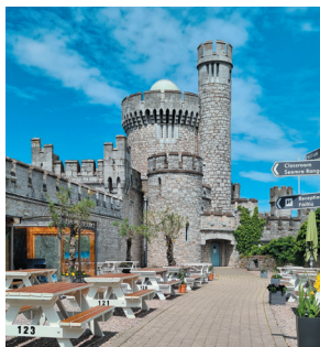
Castle Rd, Blackrock. T12 YW52

Housed in an historic 16th century fort with panoramic view of Cork harbour, MTU Blackrock Castle is home to a research observatory and science centre. Take a guided tour through the heart of the castle, enjoy the wonder of our planetarium shows and immerse yourself in our Cosmos experience and Journeys of Exploration exhibits. Delve further into space science and Ireland's astronomy heritage with our friendly Explainers.