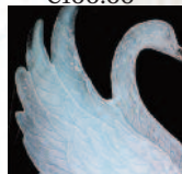
Large Classic Swan €200.00