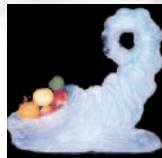
Horn of Plenty